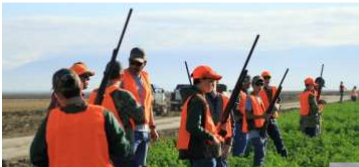
Scenes from previous Junior Pheasant Hunts: