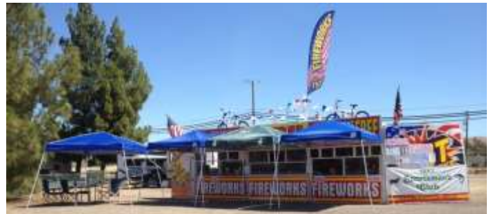
Thank you for your support of the Taft Sportsmen's Club Annual Fireworks Booth.