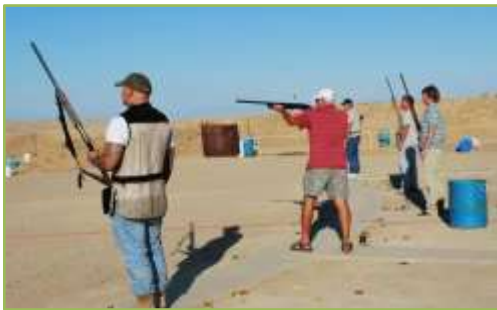
Trap shooters stepping up to the line to shoot at the weekly Trap Shoot.

In addition to the weekly trap shoots on Thursday's at 4:30 PM, we have monthly youth trap shoots on the second Monday of the month at 4:30 PM.