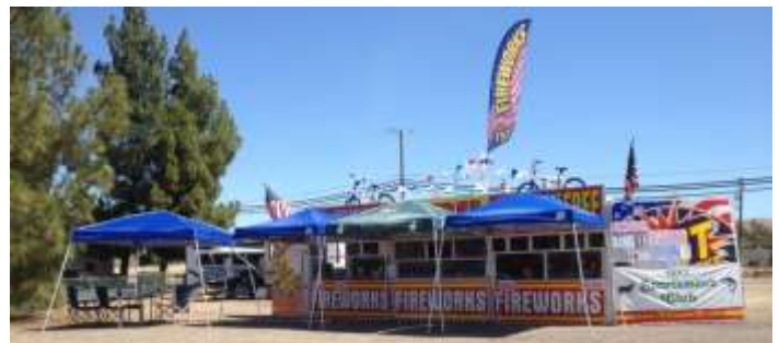
Come buy your fireworks from the Taft Sportsmen's Club at Sno White Drive In at Center and 10 th Streets!

If you would like to volunteer your time to work the booth on any of our many shifts, please call and leave a message at 661 745-0416 extension 807 or e-mail us at info@taftsc.com . And be sure to come buy your TNT Fireworks with the Taft Sportsmen's Club!