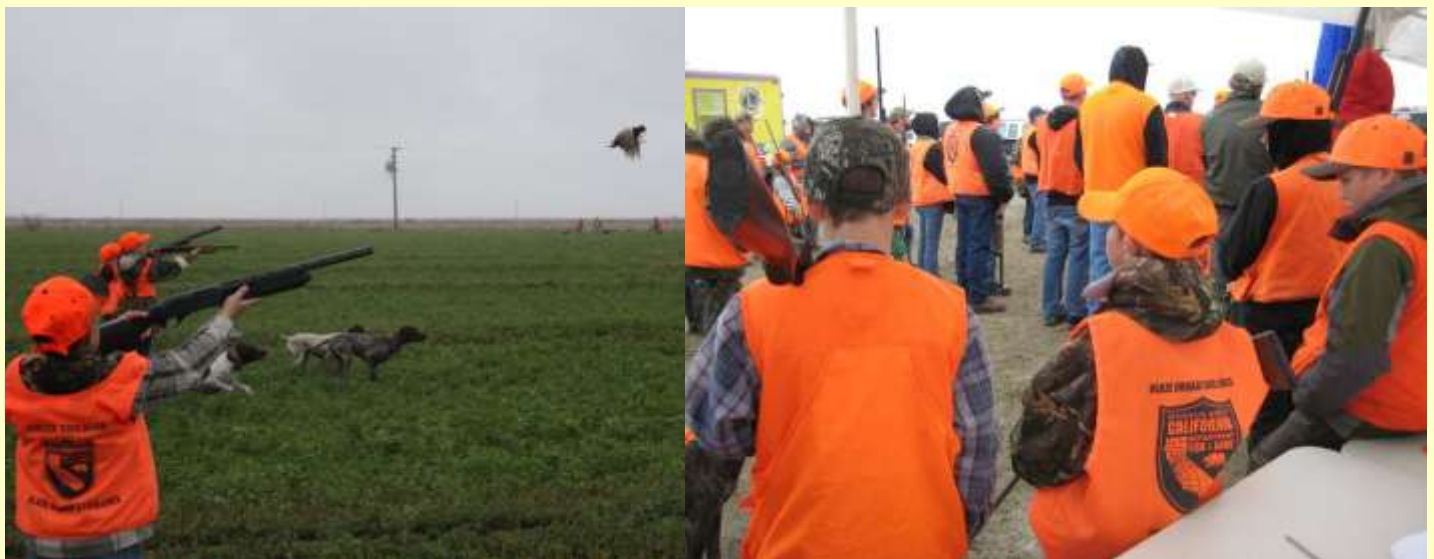
Scenes from the 2010 Junior Pheasant Hunt. This event is sure to be fun and exciting for the entire family. Get your applications in!

The deadline for application submission is November 14 or until the hunts are filled. Please be sure to watch our Facebook event page for the latest information about the event.