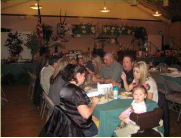
Banquet night attendees sit down for an excellent OT Cookhouse meal. The Wall of Animals and raffles prizes fill the background.