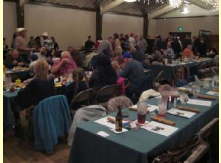
The line starts to form for dinner.