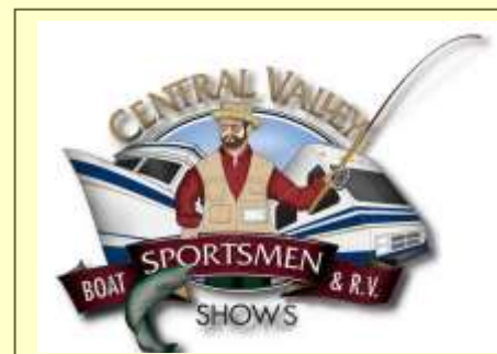
The Central Valley Sportsmen's Boat, RV, & Outdoor Living Show is at the Kern County Fairgrounds.